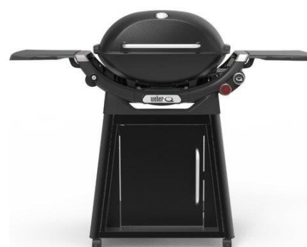
Weber Family Q3200 BBQ

Sponsor A Picket - This is your chance to share in a unique piece of Western Australian sporting history. The sponsored picket could be a birthday gift, memorial remembrance for a loved one, personal favourite spot, or just a tribute to the great memories over the years at Bassendean Oval. Your choice of location around the ground. Only $150.00