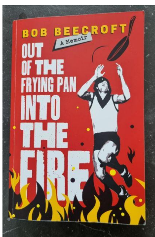
Bob's book – available in the Swan Auction