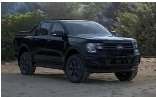
Ford Ranger Black Edition (your choice of colour)