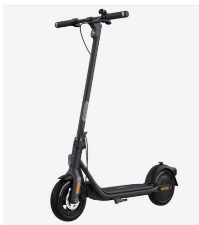
Segway-Ninebot F2 Kick Scooter