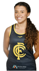
2 ND RUNNER UP