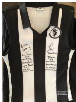
SDFC Hall of Fame Jumper Signed and Framed