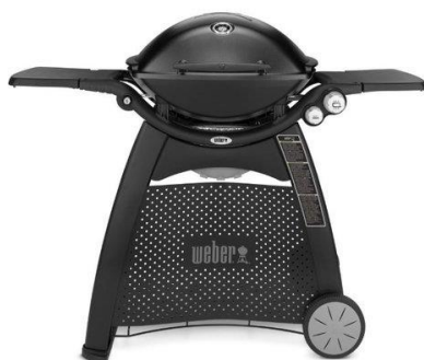
Weber Family Q BBQ (Black)