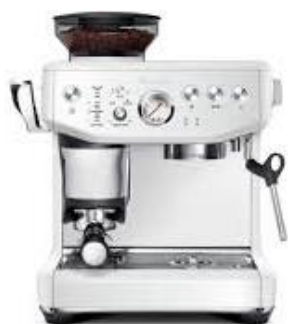
Breville The Barista Express Coffee Machine (Stainless Steel)