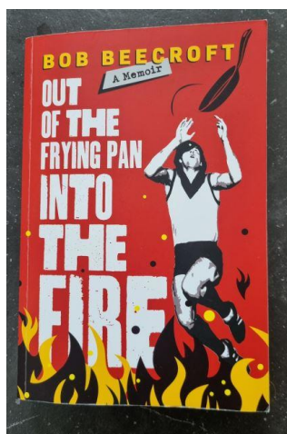
Bob's book – available in the Swan Auction