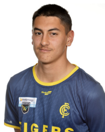
RUNNER UP 'ROY SANDERS MEMORIAL SPORTSMANSHIP TROPHY'