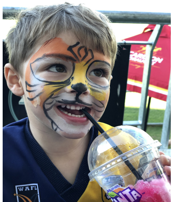
Family Fun Day