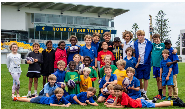
Thursday Night Clinic with Swanbourne Primary School and Bidyadanga Primary School