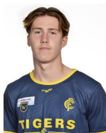
FAIREST & BEST 'TOM RICHARDSON TROPHY'