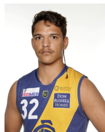
THIRD 'HUGH BUXTON MEMORIAL TROPHY'