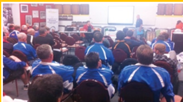
Regional Umpires receiving coaching during the 2013 Landmark Country Football Championship week

It was regrettable that this excellent opportunity had representation from only around 20% of senior affiliate leagues. Nonetheless, those that did attend found the program well worthwhile and their support will ensure the program continues again in February/March 2014.