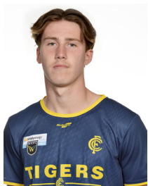
FAIREST & BEST 'TOM RICHARDSON TROPHY'