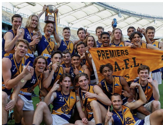
The Colts Premiers 2019

Grand Final v Peel. Terrific game of football full of significant moments for everyone. Great team effort and a reward for the entire club. Really proud of all the players who represented CFC this year in the Colts program.