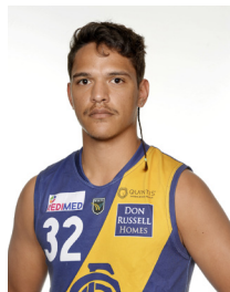
THIRD 'HUGH BUXTON MEMORIAL TROPHY'