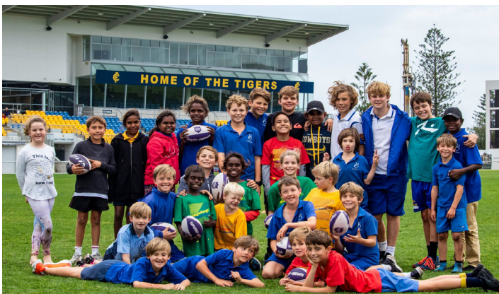
Thursday Night Clinic with Swanbourne Primary School and Bidyadanga Primary School