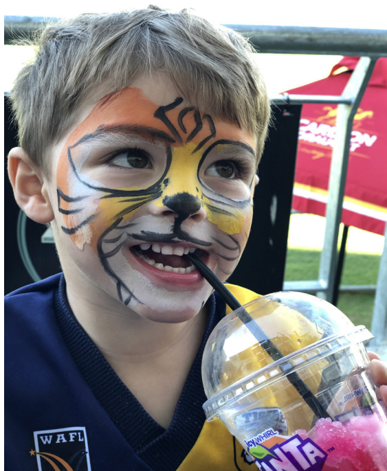
Family Fun Day