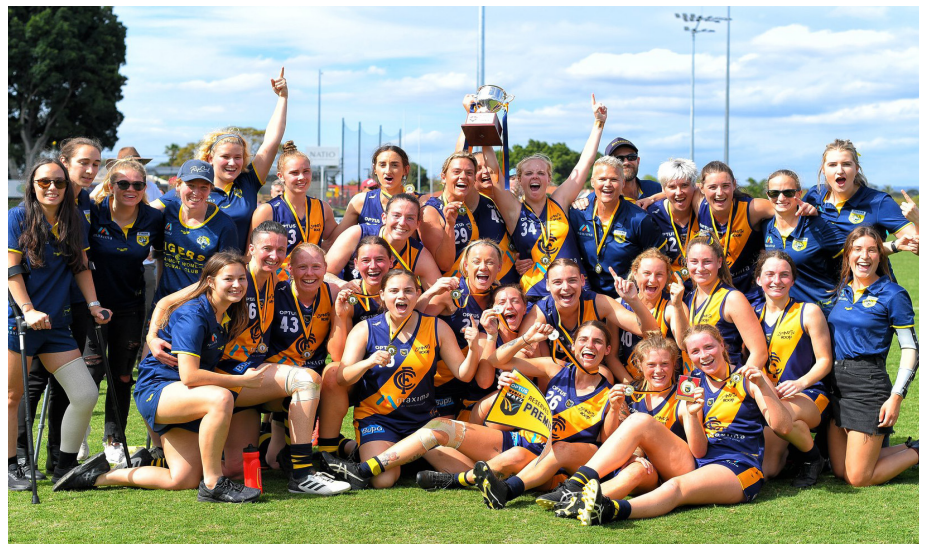
Claremont Women's Reserves Premiers 2019