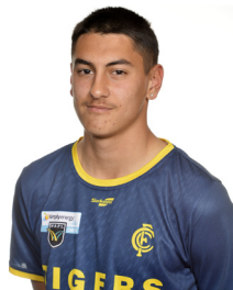
RUNNER UP 'ROY SANDERS MEMORIAL SPORTSMANSHIP TROPHY'