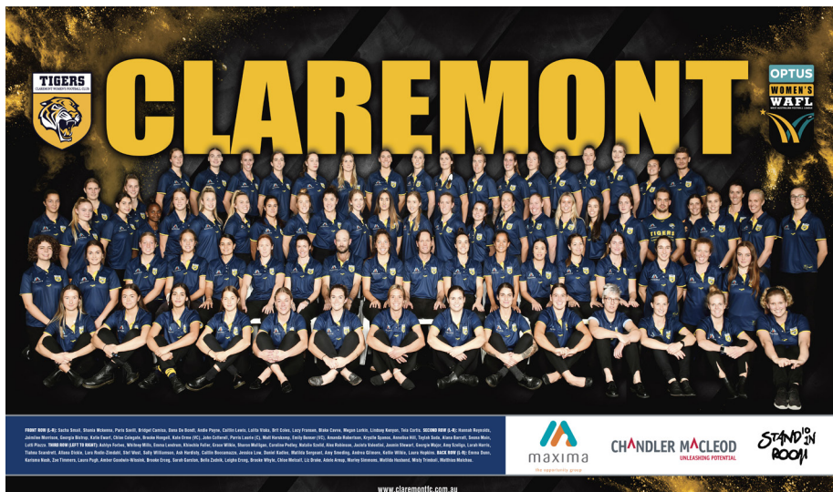
2019 Playing Group - Rogers Cup, Reserves & League