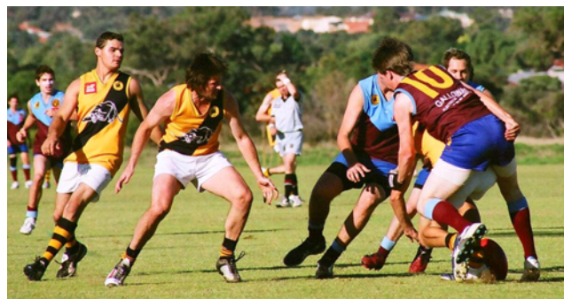
Swan View v Lynwood Ferndale C Grade, Round 6