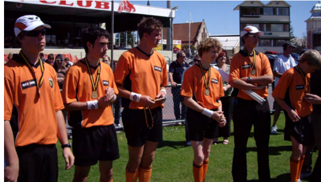
B Reserve Grand Final: