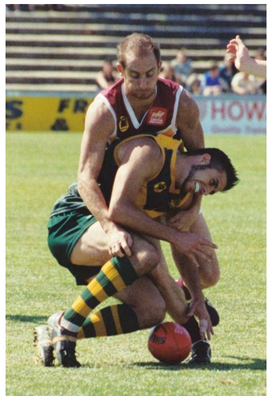
Hamersley Carine v C.B.C. B Reserve Grand Final

In recognition of its 85 th season of contribution to