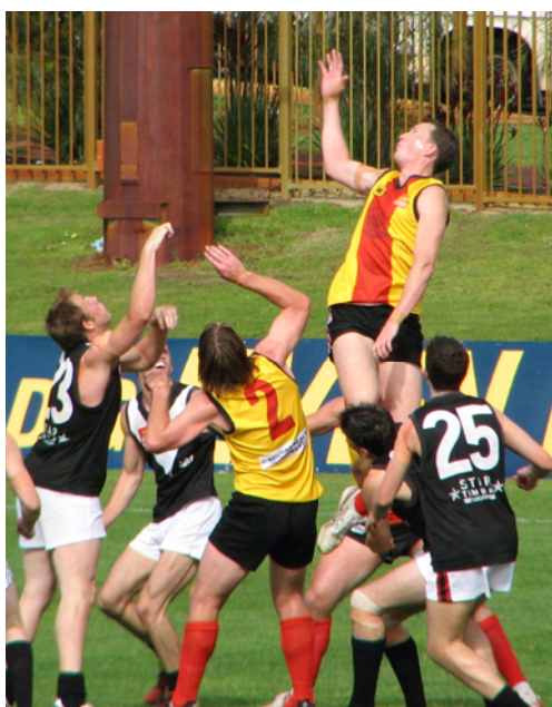
North Beach v Wembley A Grade Grand Final