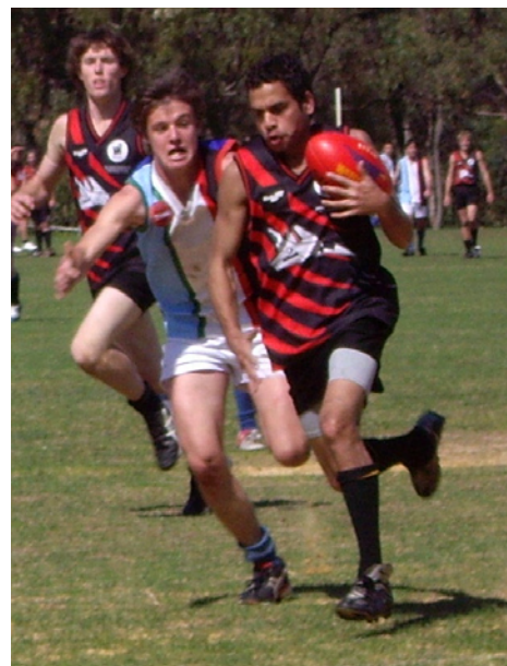
Belmont Districts v Trinity Aquinas Laurie Keene Colts 2nd Semi Final

1973 Unknown 1977 East Victoria Park 1978 Collegians 1979 East Victoria Park 1980 Innaloo 1981 Dianella (Div 1) Mt Lawley (Div 2) 1982 W.A.I.T. 1983 W.A.I.T. (Div 1) Bassendean (Div 2) 1984 Dianella 1985 Forrestdale 1986 Morley 1987 University 1988 C.B.C. 1989 Whitford 1990 University 1991 Rockingham 1992 Cowan University 1993 Ocean Ridge 1994 North Beach 1995 Brentwood 1996 Bullcreek Leeming