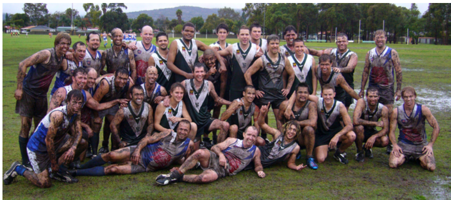
D Reserve, Swan Valley v Brentwood Round 18, Swan Valley Oval