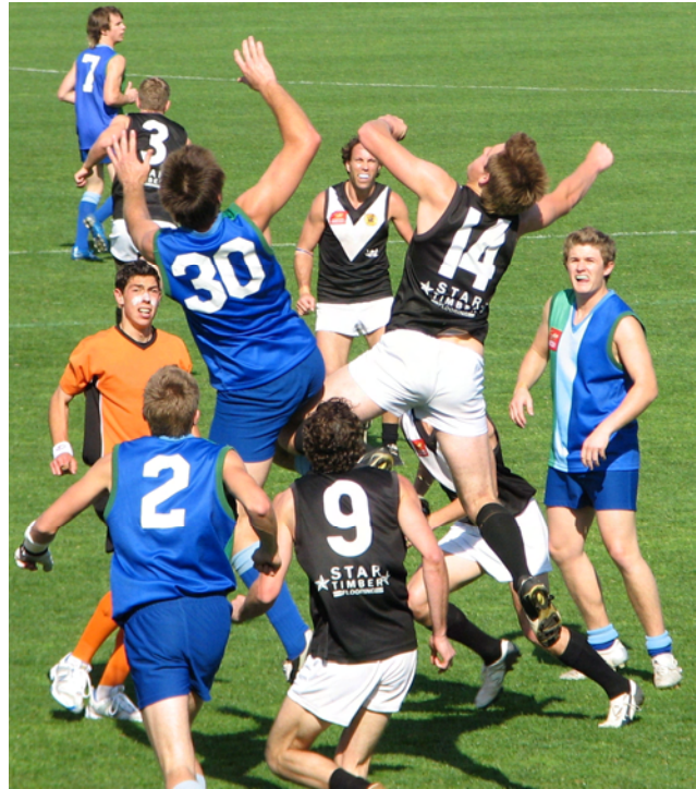
Trinity Aquinas v Wembley A Grade Preliminary Final

We continue to play a key role in the Community Football Council along with the Sunday Football League, Peel Football League, Masters Football, Women's Football League and the rejuvenated Western Australian Football Association. All associated bodies have worked closer together this season, all for the good of local and community football covering the metropolitan area.