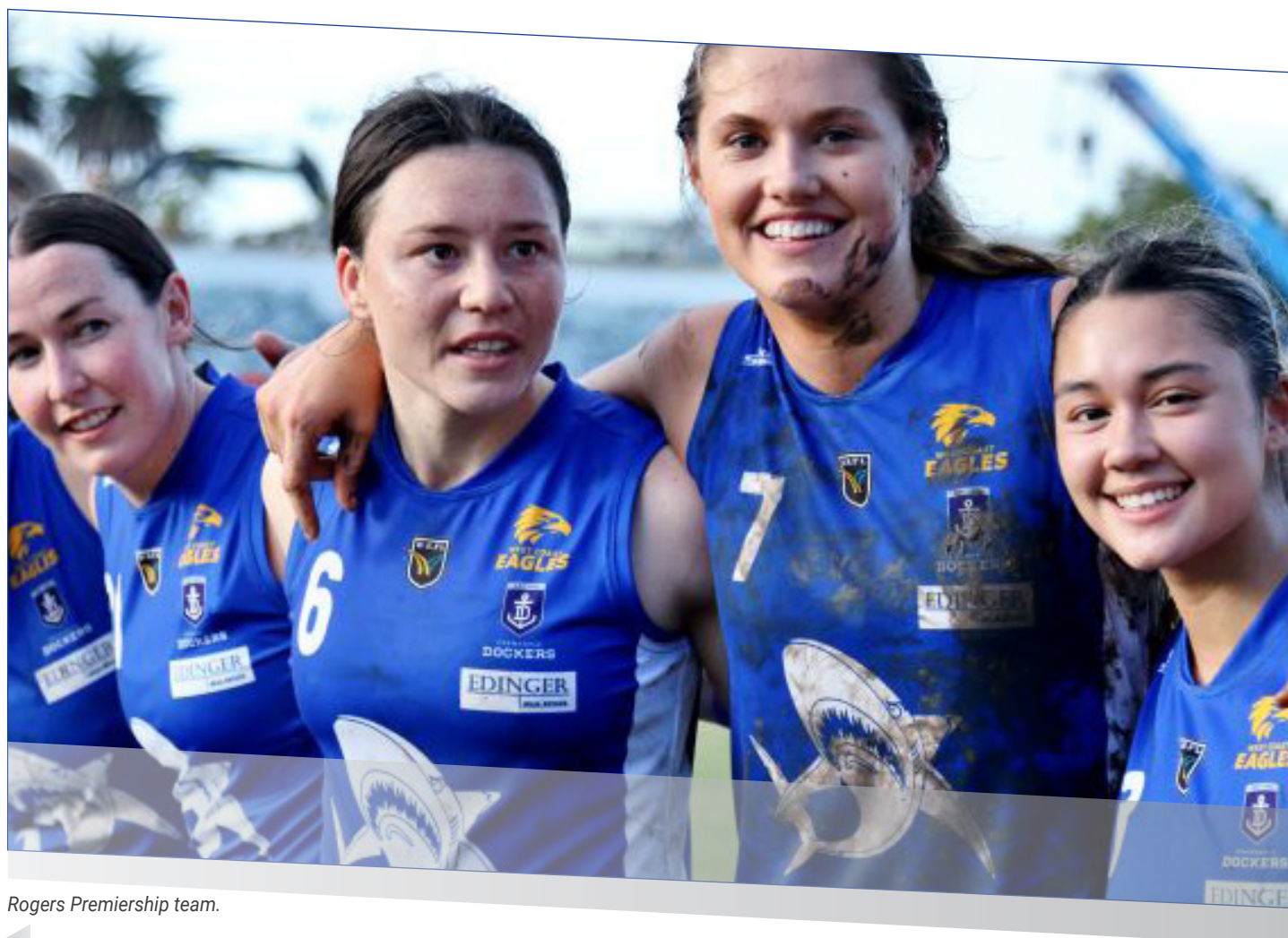
Rogers Premiership team.

I wouldn't want to play for any other club, see you in 2024 sharkies!