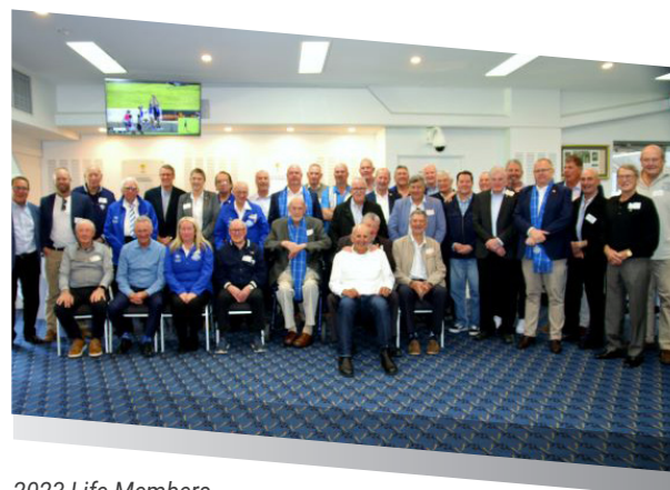
2023 Life Members