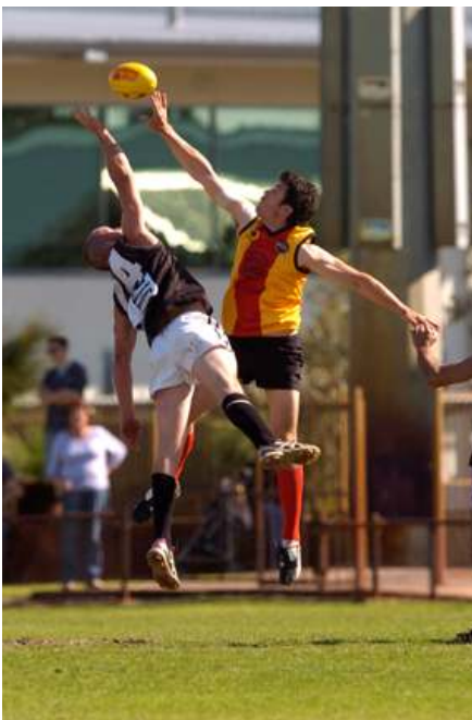
North Beach v Wembley A Grade Grand Final