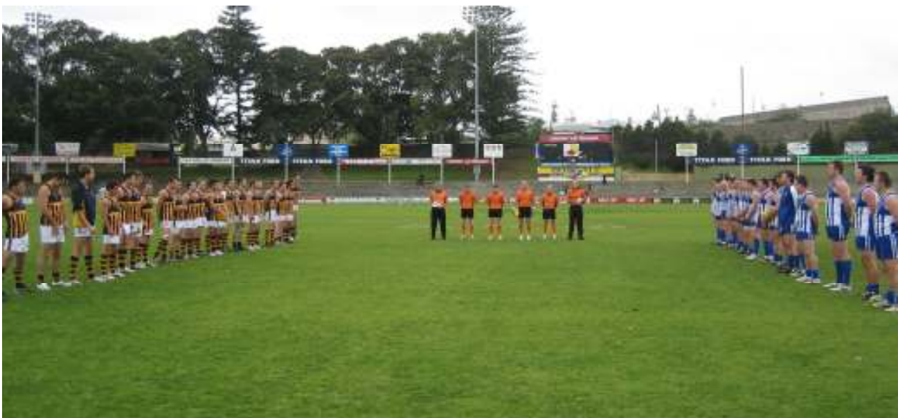
B Grade Grand Final West Coast Cowan v Whitford