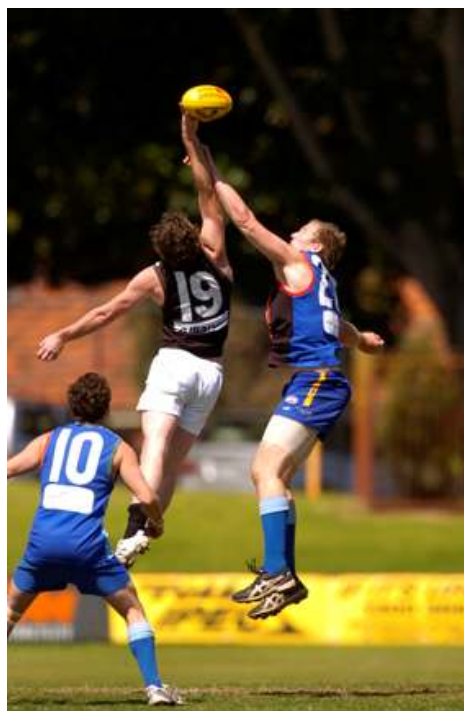
A Reserve Grand Final Wembley v Trinity Aquinas