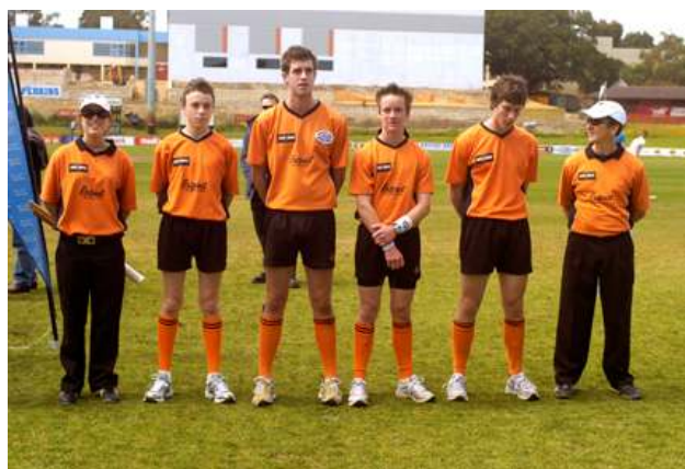
Umpires from the Phil Scott Colts Grand Final