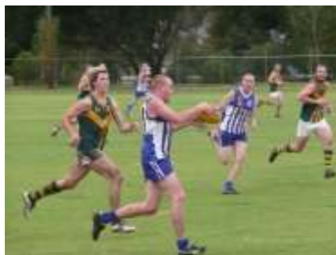
CBC v Whitford B Thirds Grand Final