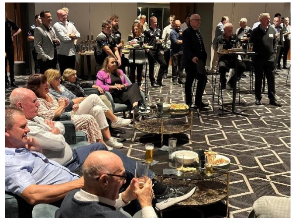
Attendees focused in on the Guest Speaker