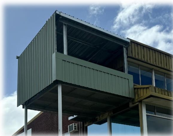
The finished product