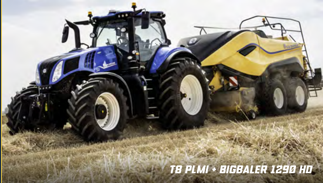
T8 PLMI + BIGBALER 1290 HD