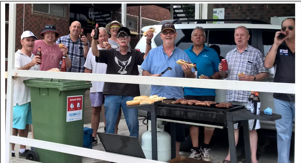
Swansmen hard at work at the Busy Bee in February