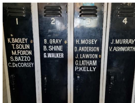
The old lockers, dating back to the 1960's feature 100 game players.