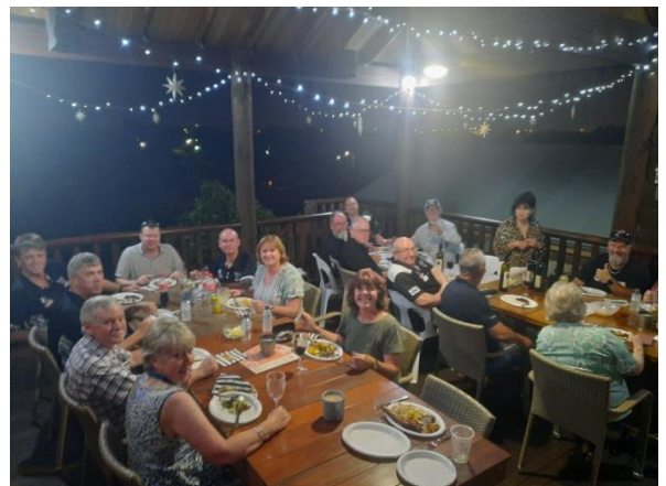
Members and partners enjoying the after Seminar dinner