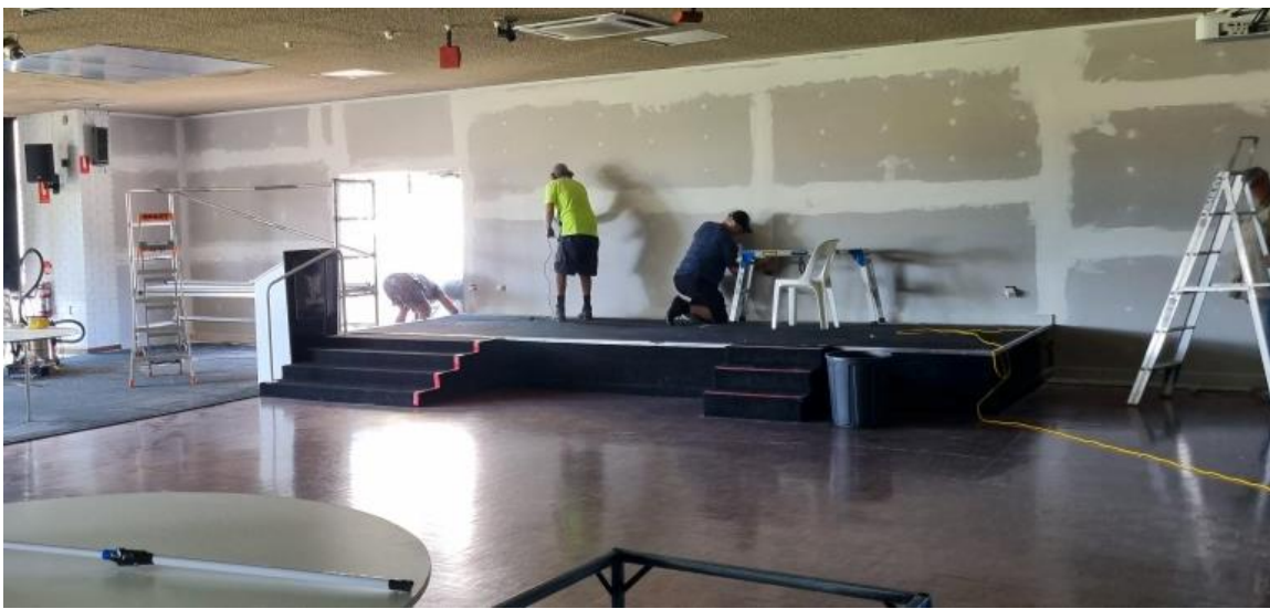
Final day sanding