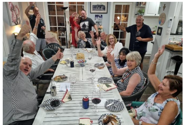
Members and partners enjoying the after-Seminar dinner