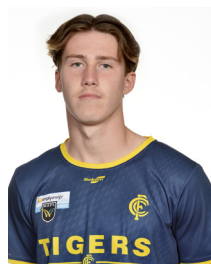
FAIREST & BEST 'TOM RICHARDSON TROPHY'