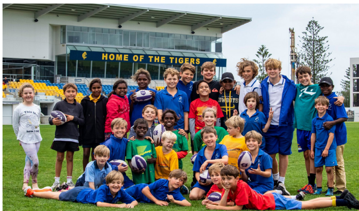
Thursday Night Clinic with Swanbourne Primary School and Bidyadanga Primary School