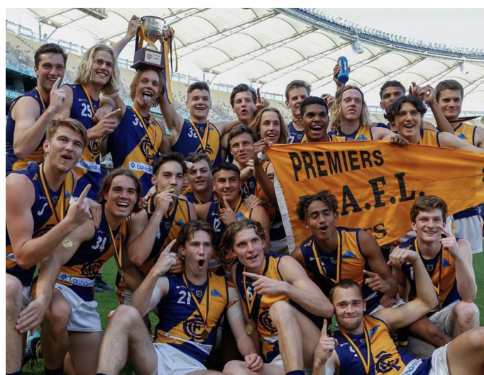
The Colts Premiers 2019

Grand Final v Peel. Terrific game of football full of significant moments for everyone. Great team effort and a reward for the entire club. Really proud of all the players who represented CFC this year in the Colts program.