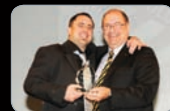
T.K. Naylor Award Colts Champion Club