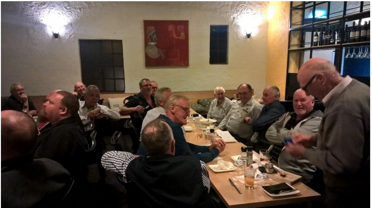
Coops entertains the troops at the October Away Meeting at the Bassendean Hotel