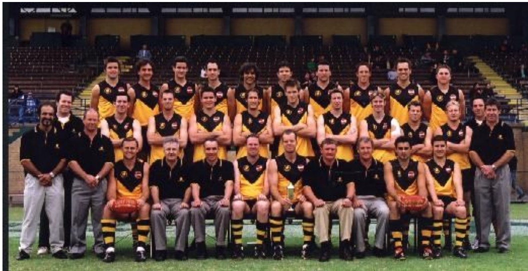
2003 State Senior Team