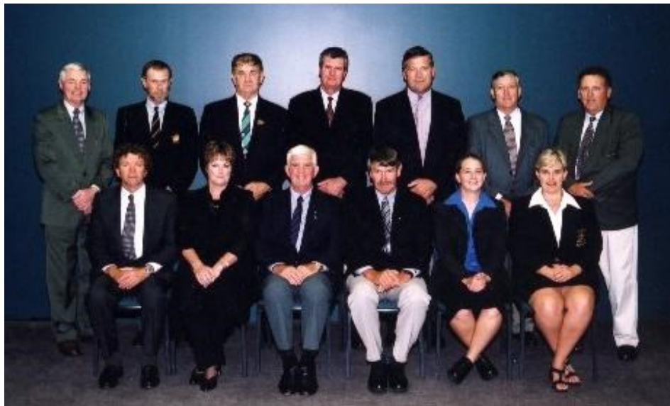
COMMUNITY FOOTBALL COUNCIL 2003