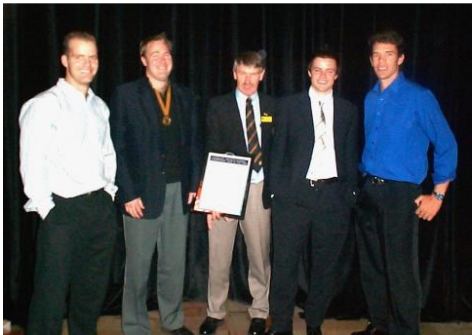
WAAFL Players selected in the 2003 Australian Amateur Team of the Year