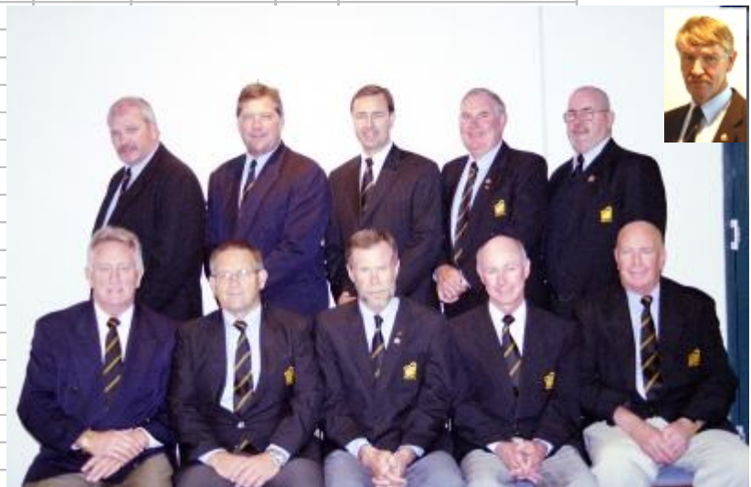
2003 Management Committee