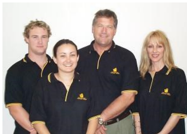
2003 WAAFL STAFF