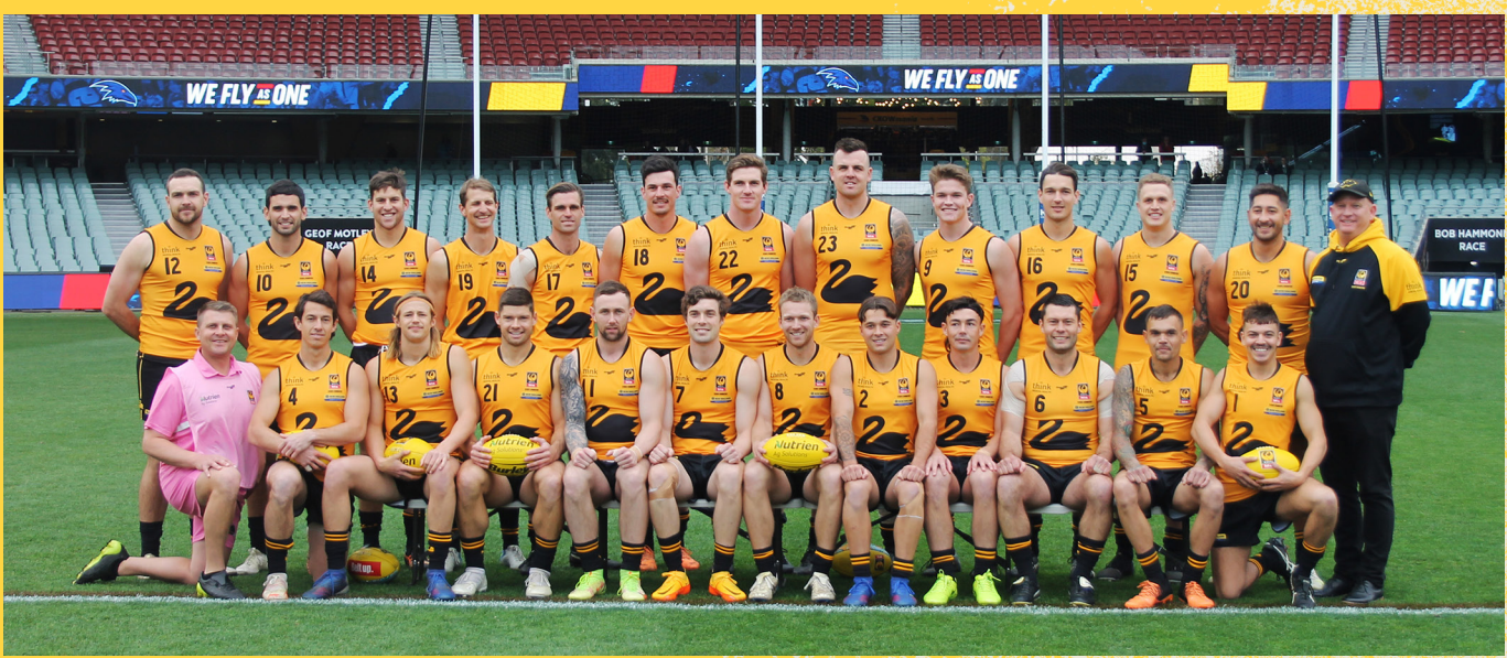
WACFL NEW HOLLAND STATE MEN'S TEAM