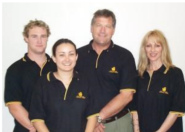
2003 WAAFL STAFF