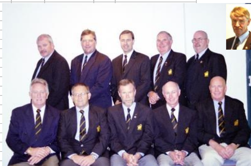
2003 Management Committee