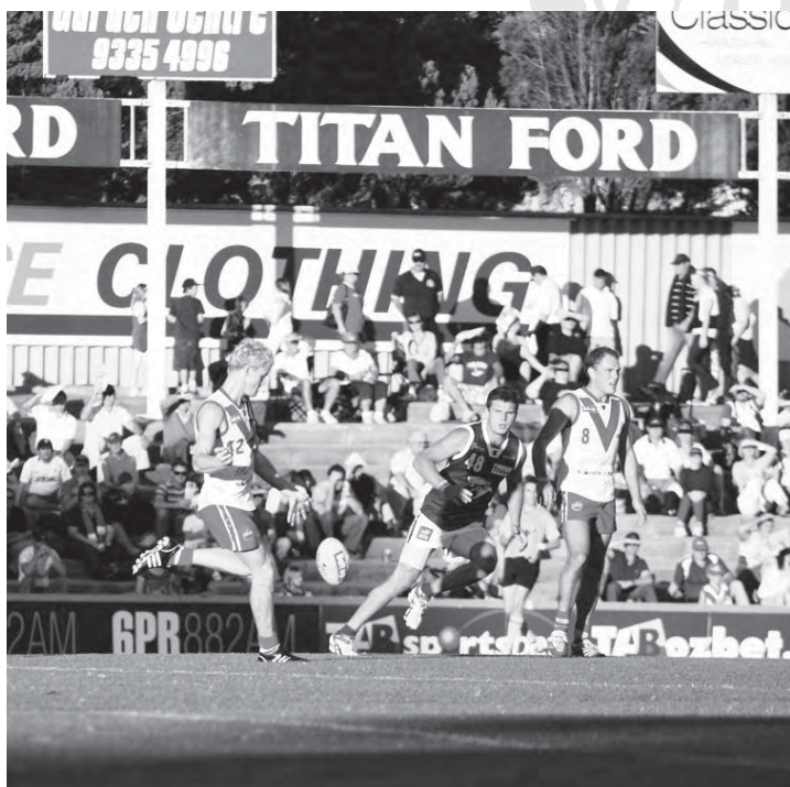
And perfect kicking pose