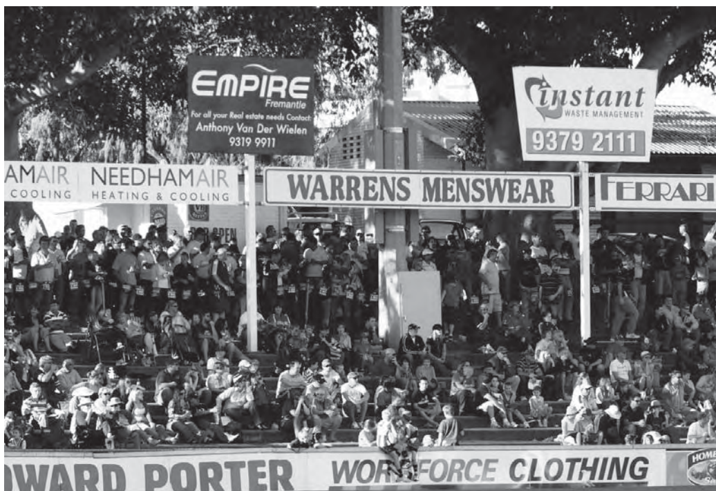
Foundation Day Derby Monday 2 June 2008